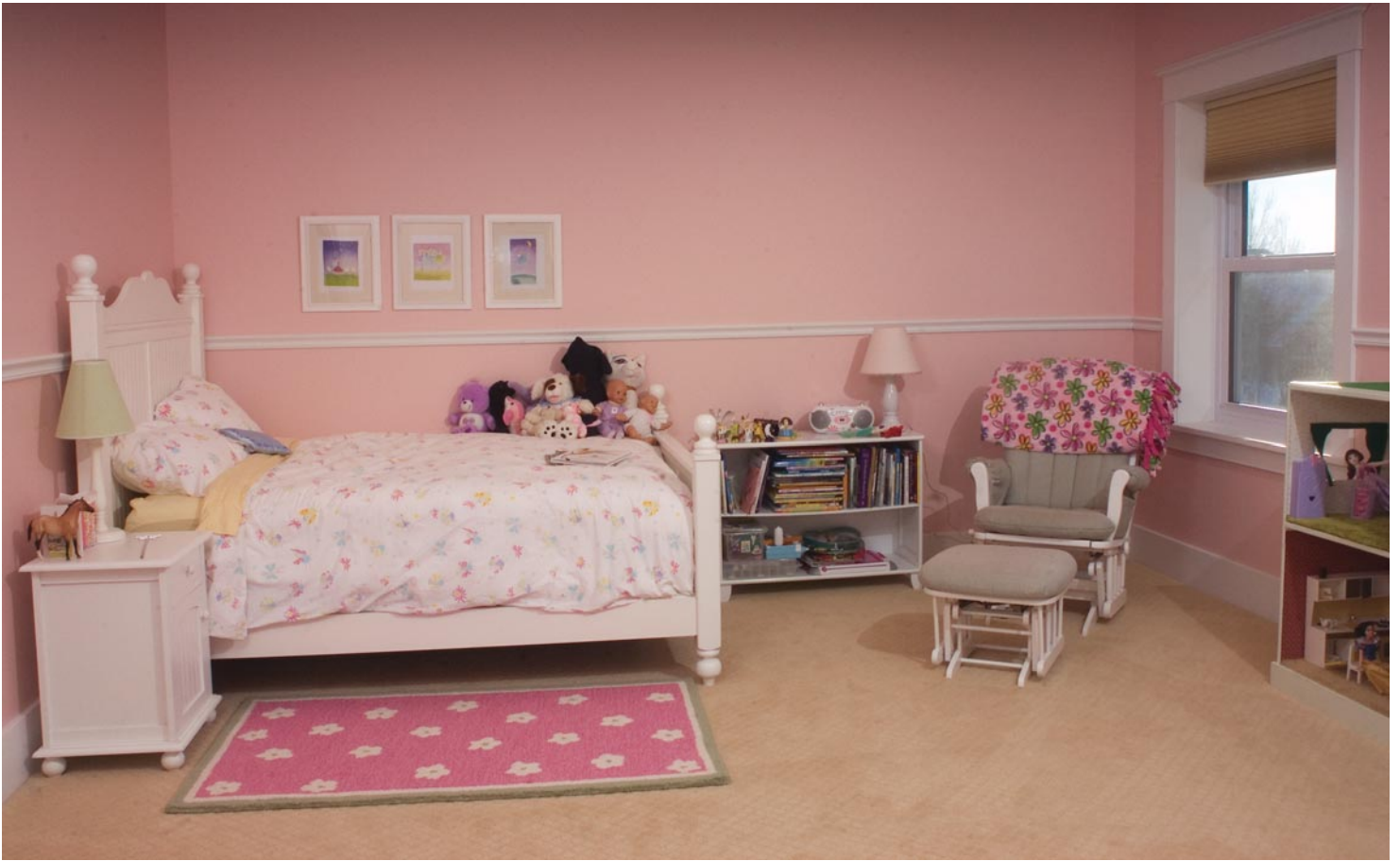
Top: A "pretty in pink" little girl's room has a princess theme and plenty of space to play. The doll-house in the room was originally built by the little girl's grandfather for her aunt and mother when they were children.